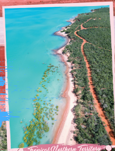
Tropical Northern Territory