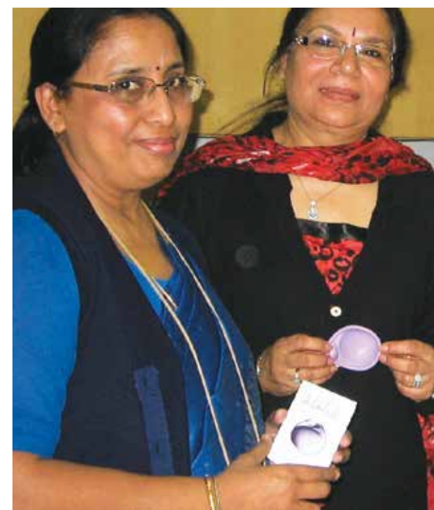
Scientists at the Division of Reproductive and Child Health, Indian Council of Medical Research provided input into the health systems assessment in India in 2012.