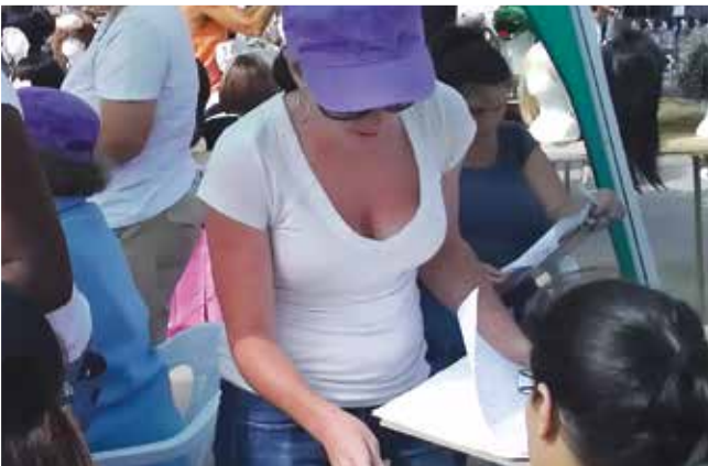
Researchers went to the boardwalk in Venice, CA to recruit a cross section of women for the label comprehension study.