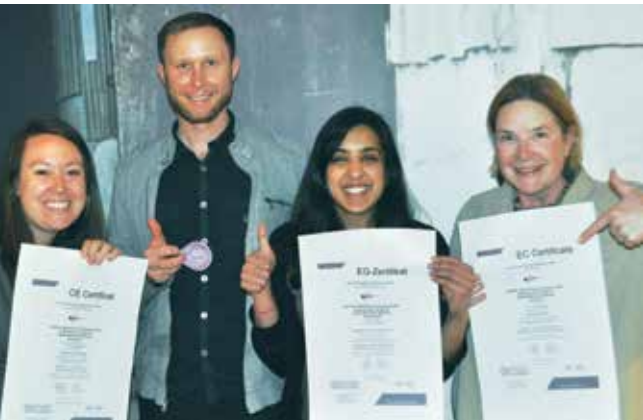
PATH team celebrating the CE Mark approval in April 2013.