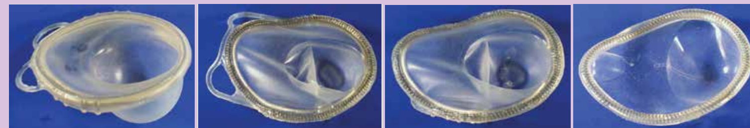
Early versions of the SILCS diaphragm prototypes. Design elements such as grip dimples, removal features, spring shape, and cervical cup evolved based on user/provider feedback.