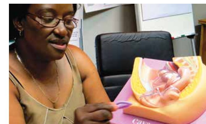
MatCH Research provided feedback about the Caya pelvic model during the health systems assessment in South Africa.

Stakeholders agreed there is need for nonhormonal alternatives for women who cannot use or want to avoid hormonal methods. SILCS was found acceptable for a range of women including urban and rural, married and single, and younger and older, and could provide an alternative when condoms cannot be used. Market research identified that Black women from middle- and lower-income groups were more interested in SILCS than higher-income women from other racial categories. And women were much more interested in using SILCS plus a microbicide gel together to protect from both pregnancy and HIV and other sexually transmitted infections (STIs) than in using SILCS just for contraception.