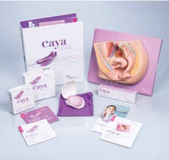
Kessle developed an array of marketing materials to support Caya introduction, now available in 14 languages.