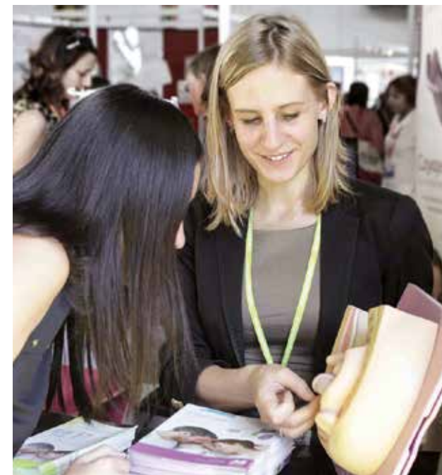
Demonstrating the Caya diaphragm at a midwifery conference in France.