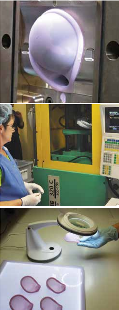
Caya production and quality control at Kessel’s manufacturing facility.

By late 2012, production was validated with an optimized manufacturing process, which included using retractable pins to hold the contoured spring in the