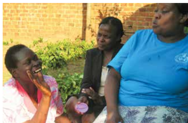
A family planning provider and researcher introduce SILCS to a former diaphragm user who had promoted diaphragms to her community decades ago when they were available.

Some product development stories end here, with a product approved by multiple regulating agencies, low-cost manufacturing established, and promotion to initial target audiences in select countries completed. But to reach women in low-income countries—who currently do not have access to a diaphragm—PATH and partners built evidence of the value proposition for this new method and created a roadmap for introduction. Health systems assessments, market research, and cost-effectiveness/health-impact modeling were implemented to describe characteristics of women likely to be interested in SILCS, how it can be introduced, and how it could improve women’s reproductive health—especially in countries with a limited contraceptive method mix and high unmet need for birth-spacing methods.