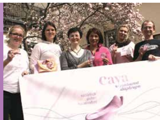
The Kessel team celebrating the first sale of Caya in Germany in 2013.

*DiaphragmsAndCaps discussion board (women members only). Available at: https://groups.yahoo.com/neo/groups/DiaphragmsAndCaps/info .